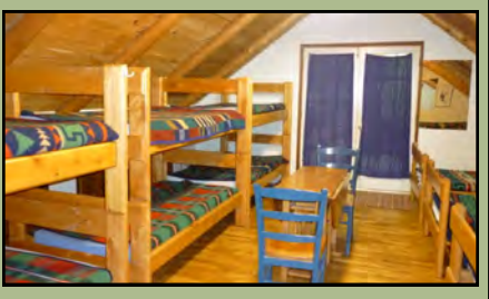
Dorm-style Guest Room