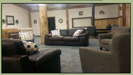
Grand Conference Room