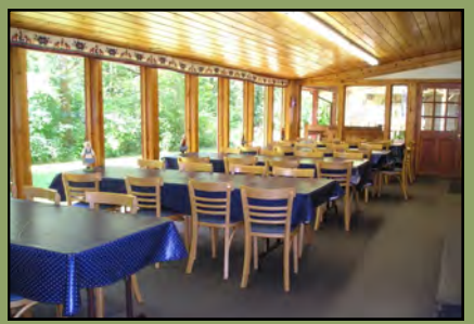
The Sunroom Dining