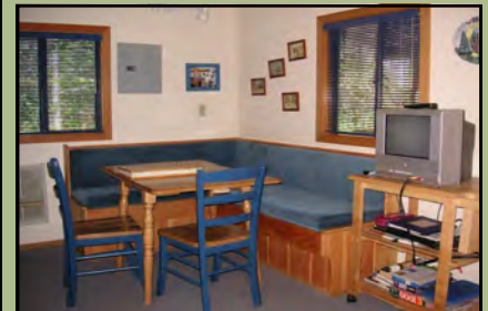
The Dalarna Cabin

The Main Lodge has lodging in private rooms, family rooms, dormitory-style rooms & cabins.