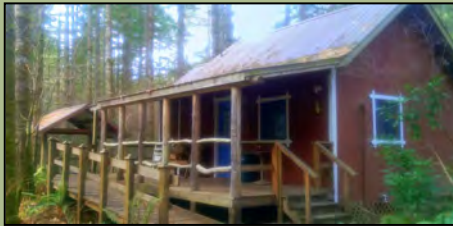
The Dalarna Cabin