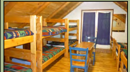
Dorm-style Guest Room