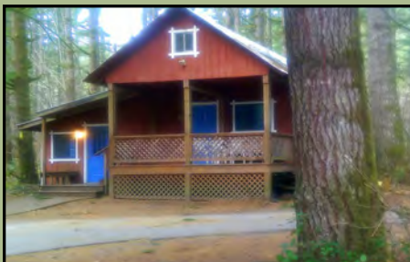
The Bunk House