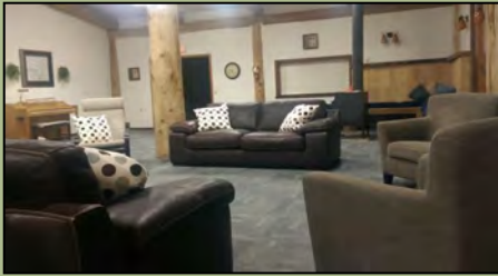
Grand Conference Room