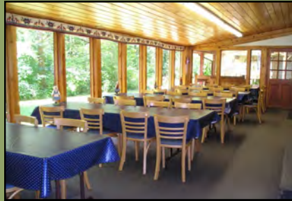
The Sunroom Dining