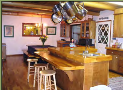
Well Stocked Kitchen