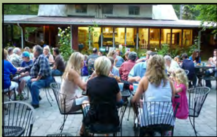
Dining on the Patio